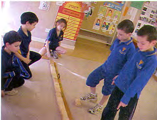
Students exploring questions about a mining disaster measure the length of the mine shaft with unifix cubes.

■ Fostering thinking requires making thinking visible. Thinking happens